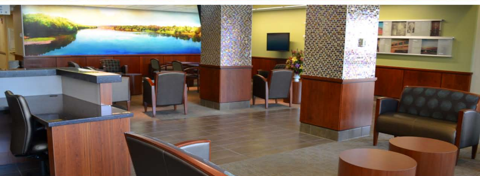
top to bottom: The entrance of the new Surgical and Cardiovascular Expansion building; new operating rooms, built to be 63% larger than current ORs and to accommodate today's advanced technology and enhanced support systems; and lobby area of Donehower-Eisenhower Pavilion, the entrance to the new expansion.